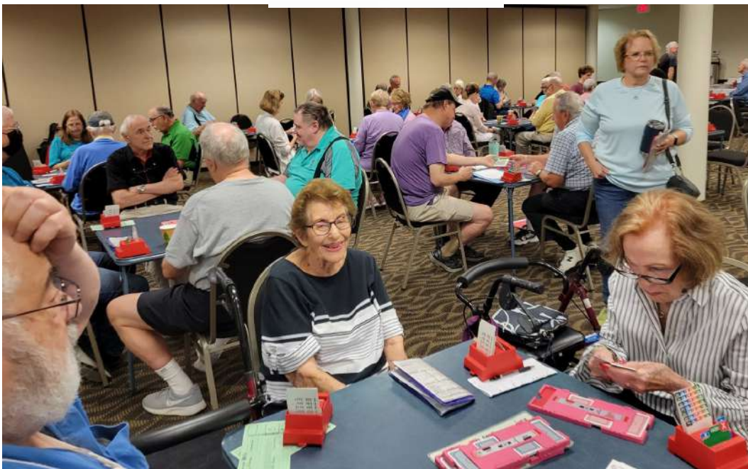
Players enjoying the After-Labor Day Tournament in Northbrook.